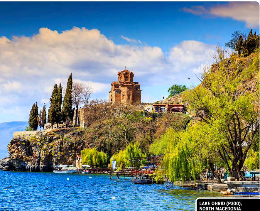
LAKE OHRID (P300), NORTH MACEDONIA