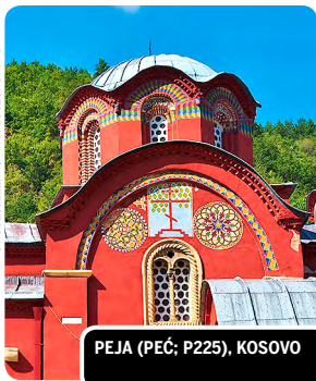
PEJA (PEĆ; P225), KOSOVO