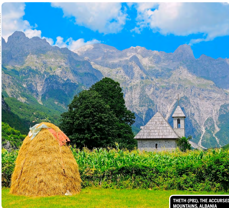
THETH (P81), THE ACCURSED MOUNTAINS, ALBANIA