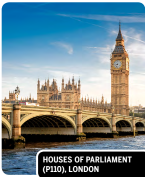
HOUSES OF PARLIAMENT (P110), LONDON