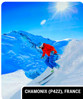
CHAMONIX (P422), FRANCE