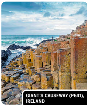
GIANT'S CAUSEWAY (P641), IRELAND