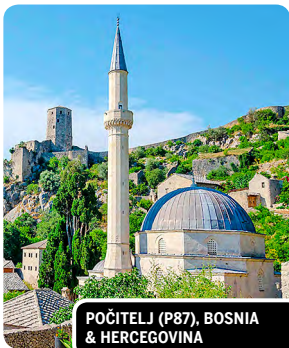
POČITELJ (P87), BOSNIA & HERCEGOVINA