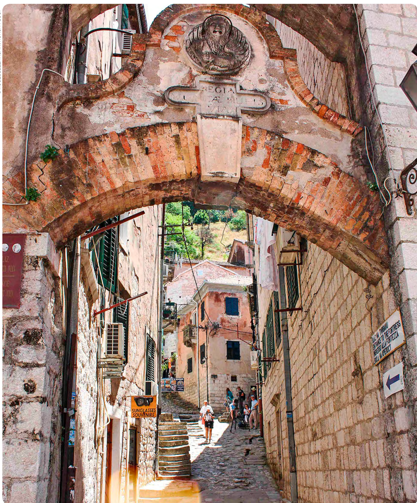
Top: Kotor's Old Town (p279), Montenegro Bottom: Cathedral of St Sophia in Veliky Novgorod, Russia