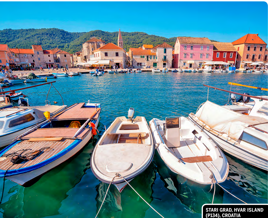
STARI GRAD, HVAR ISLAND (P134), CROATIA