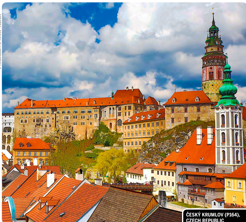
ČESKÝ KRUMLOV (P164), CZECH REPUBLIC