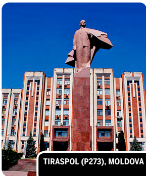
TIRASPOL (P273), MOLDOVA