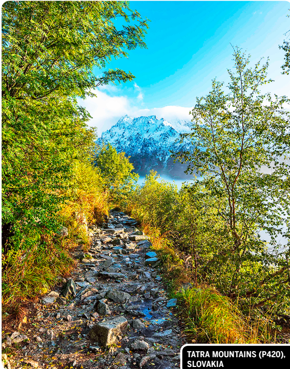
TATRA MOUNTAINS (P420), SLOVAKIA