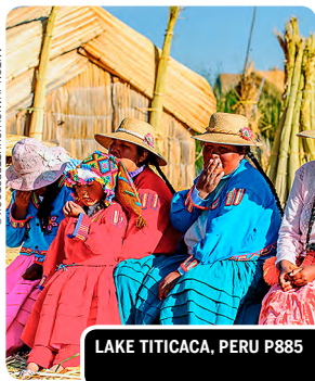
LAKE TITICACA, PERU P885