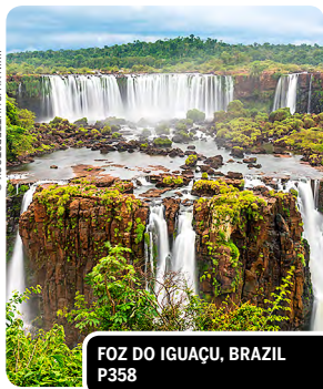
FOZ DO IGUAÇU, BRAZIL P358