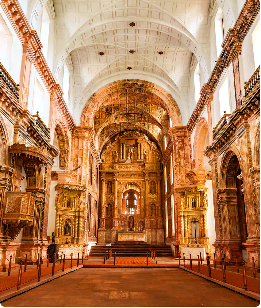
Top: Church of St Francis of Assisi (p103), Old Goa Bottom: Beach, Calangute (p129)